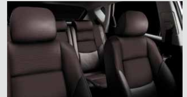
Black leather and cloth seat trim