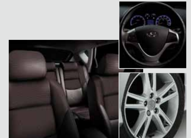
Leather and Cloth Seat Trim (seat facings only)