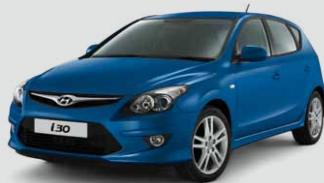
Vivid Blue (Metallic)