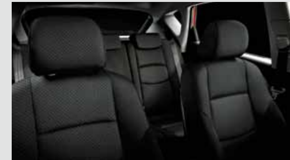
Black cloth seat trim