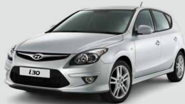
Continental Silver (Metallic)