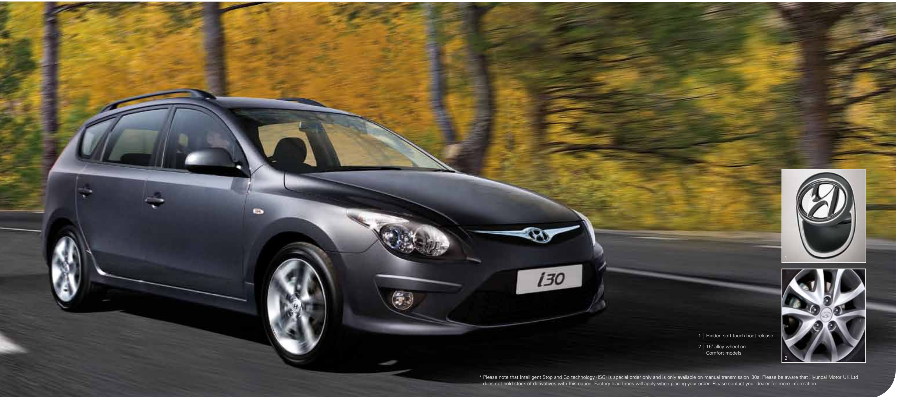
1 | Hidden soft-touch boot release

What is quality? We'll help you find the answer.