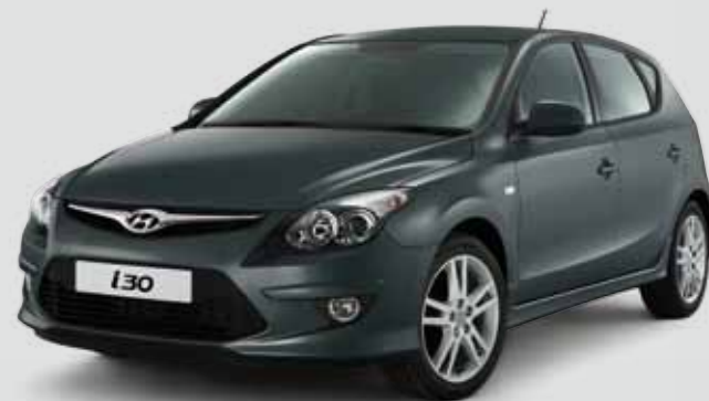
Steel Grey (Metallic)