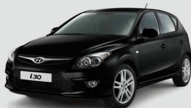
Stone Black (Mica)

Please note that all paint colours shown here are available across the i30 range.