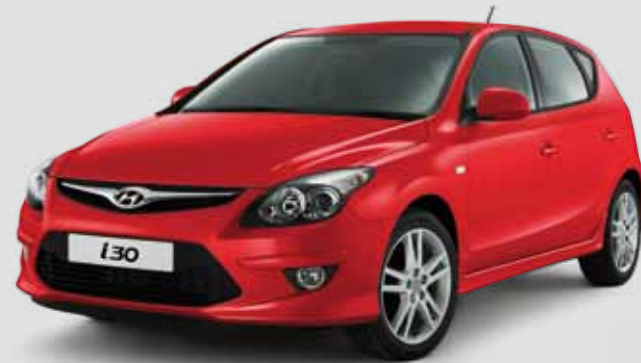
Shine Red (Solid)