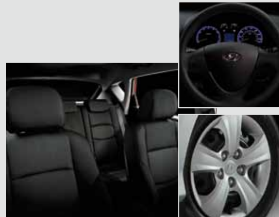
Cloth Seat Trim