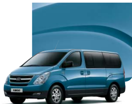
Blue Diamond § (Metallic)