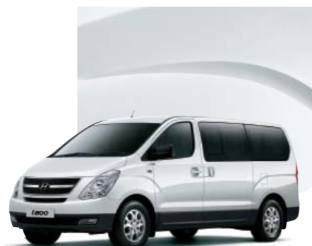
Ceramic White (Solid)