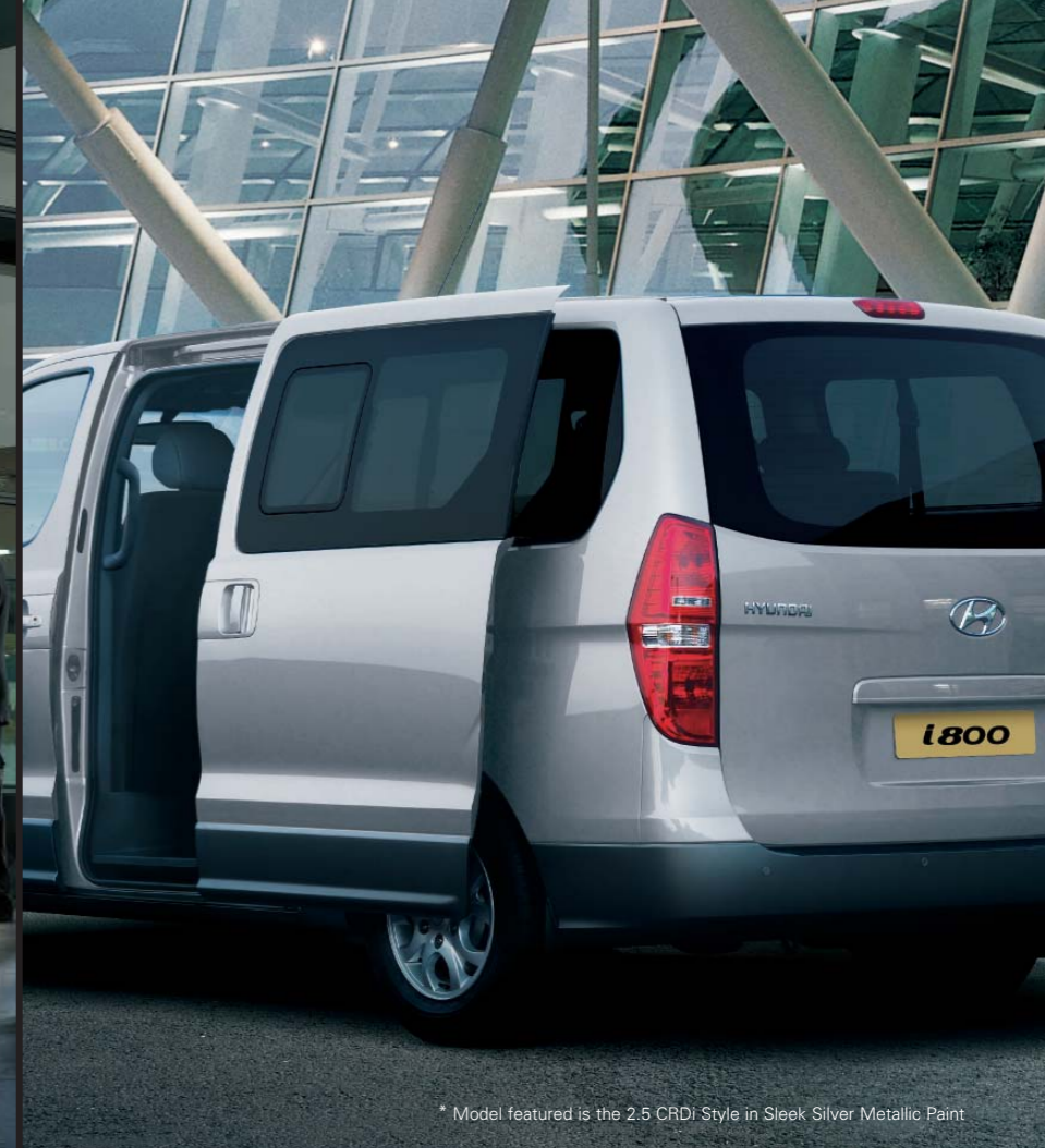
* Model featured is the 2.5 CRDi Style in Sleek Silver Metallic Paint