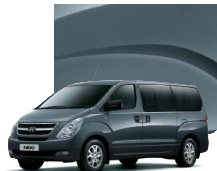
Grey Titanium (Mica)