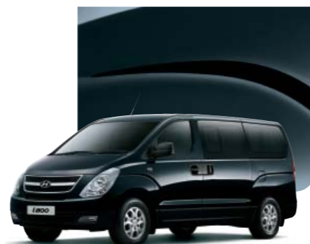
Space Black (Mica)