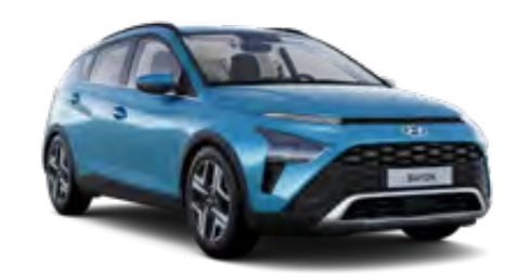
Aqua Turquoise Metallic<sup>1</sup>