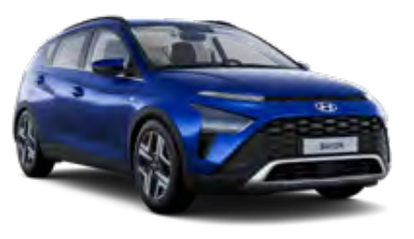
Intense Blue Pearl<sup>1</sup>