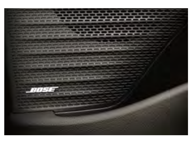
Bose premium audio system. Standard on Ultimate trim.

Wireless charging. Standard on Premium and Ultimate trims.