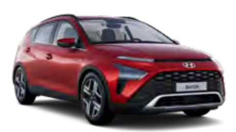
Dragon Red Pearl<sup>1</sup>