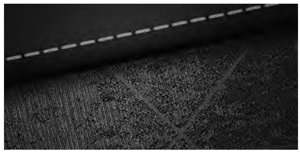
Grey and black cloth seats. Standard on all trims.

A calm colour and trim concept with subtle accents creates a serene atmosphere which helps you relax and focus on your drive.