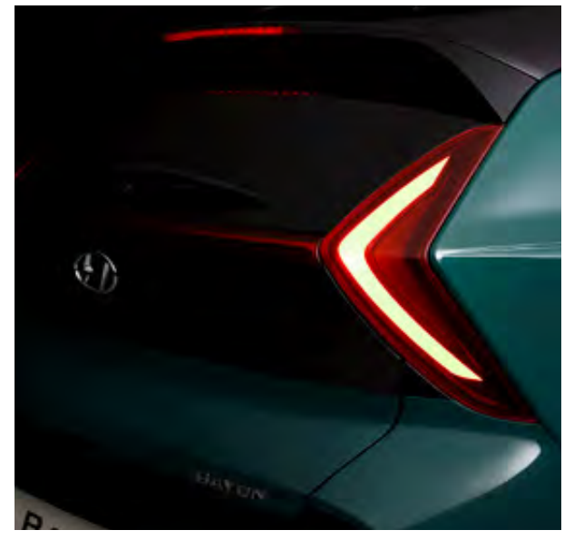
Page 3. Progress is our passion