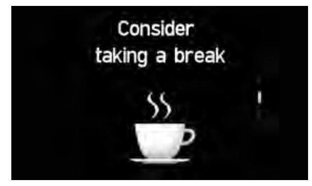
Driver Attention Warning (DAW): When a pattern of fatigue or distraction is identified, the system gets your attention with an alert and pop-up message suggesting a break.