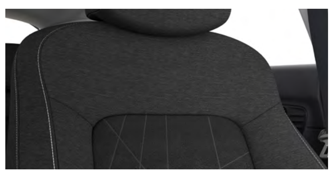
Grey and black cloth seats. Standard on all trims.