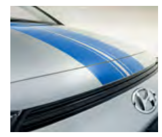
Page 27. Accessories