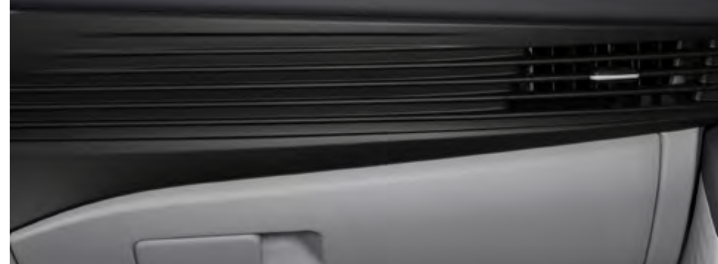
Black and grey dashboard. Standard on Ultimate trim.

Black dashboard. Standard on SE Connect and Premium trims.