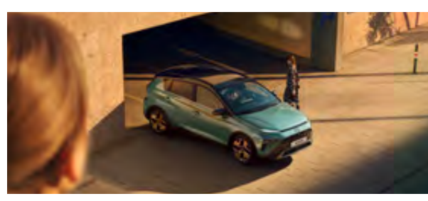
Page 4. Ready for new heights