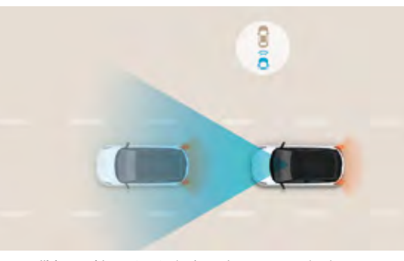
Front Collision Avoidance (FCA): The front view camera and radar sensors warn drivers of imminent collisions with vehicles and objects, applying the brakes when necessary to avoid collisions.